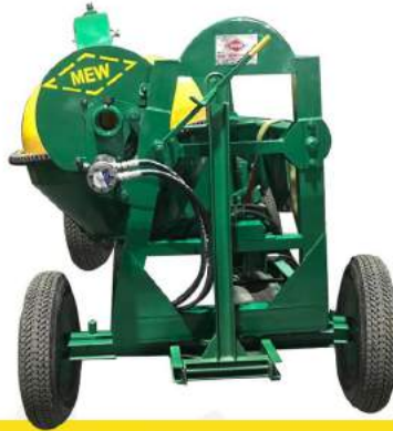
Hydraulic Hopper Mixer Machine with Power Steering