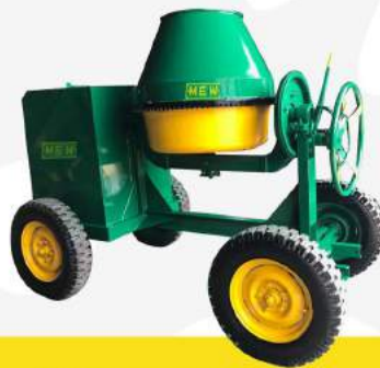
7/5 Mixer Machine