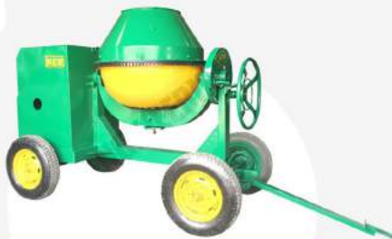
10/7 Without Hopper Mixer Machine