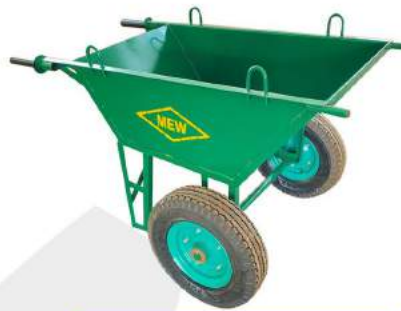
Wheel Barrow - II