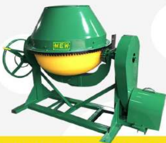
Stand Type Mixer Machine With 5HP Electric Motor