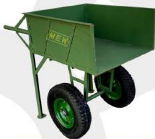
Wheel Barrow - IV