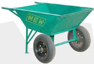
Wheel Barrow - I