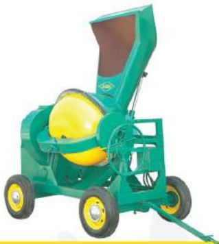
Hydraulic Hopper Mixer Machine