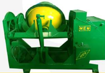
Stand Type Mixer Machine With Hydraulic Hopper and 5HP Motor