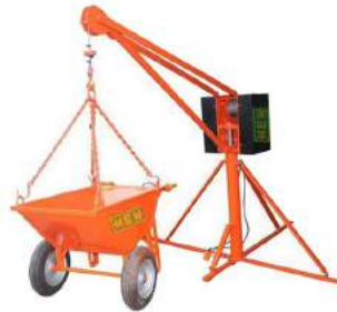
Mini Lift 360°