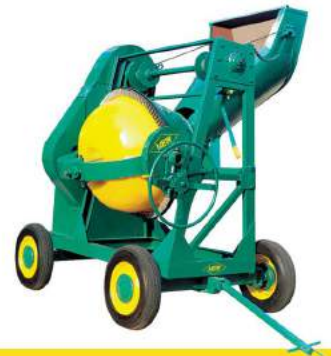
Clutch Type Mixer Machine