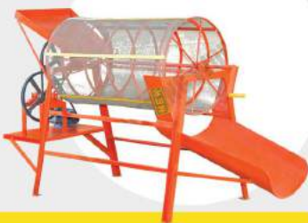
Sand Seiver Rotary Type