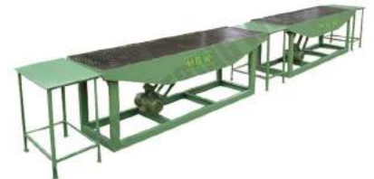
Vibro Forming Table