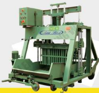
Concrete Block Making Machine