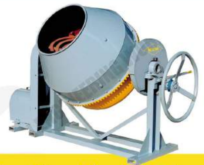
Stand Type Mixert Machine With 3HP Electric Motor