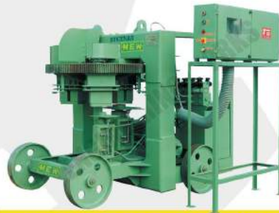
Automatic Brick Making Press Machine