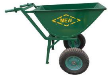
Wheel Barrow - III