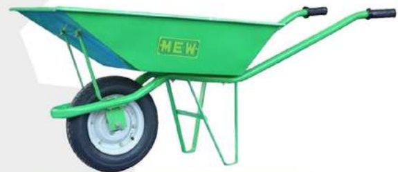
Single Wheel Barrow